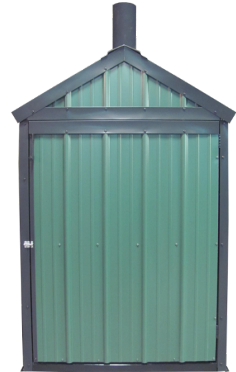
Furnace Back with Workstation Door Closed