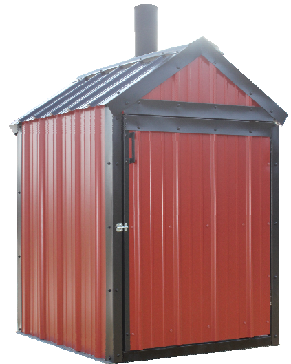
Furnace Back with Work Station Door Closed